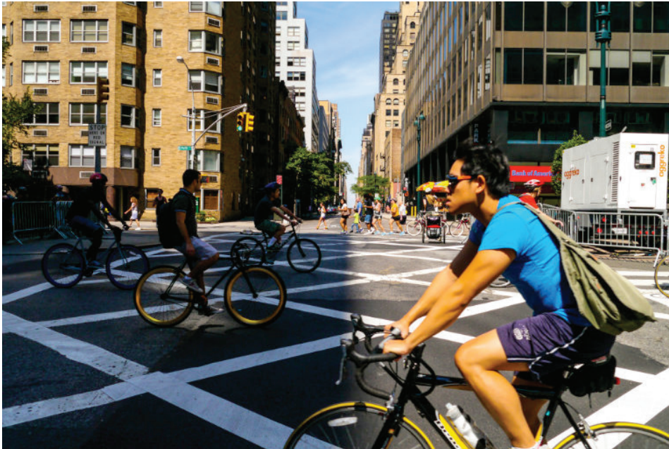
Less than 10 percent of U.S. households are car-free.